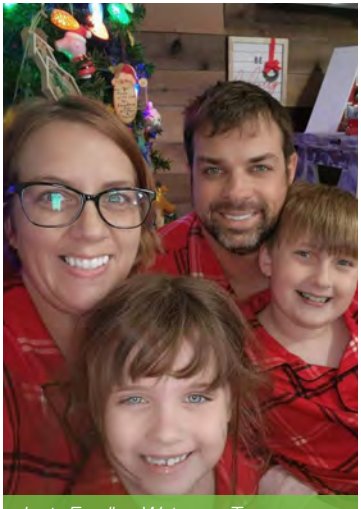
(Cameron Classic Homes, Gateway